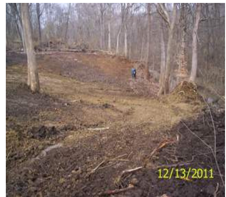
Photos of an area before and after a tire clean up took place. (this location is not in any of our communities) - Let's not let our communities become the "before" photo!