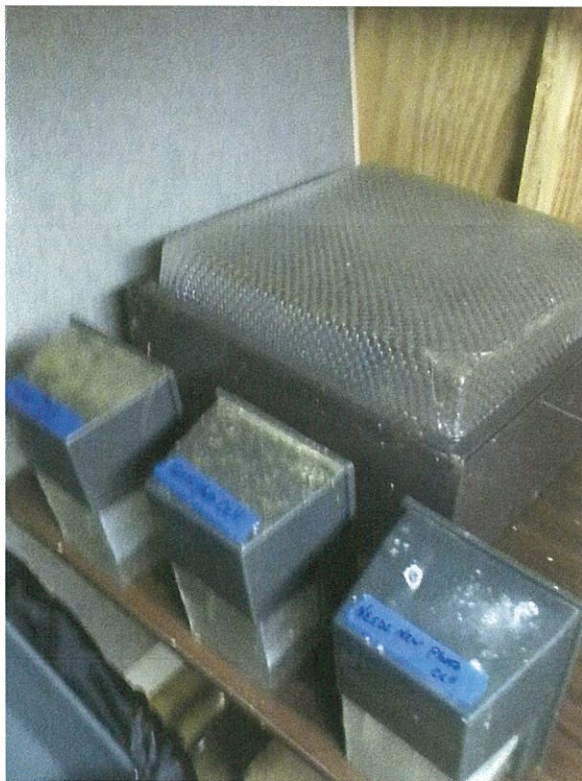
Entrance Light Fixtures