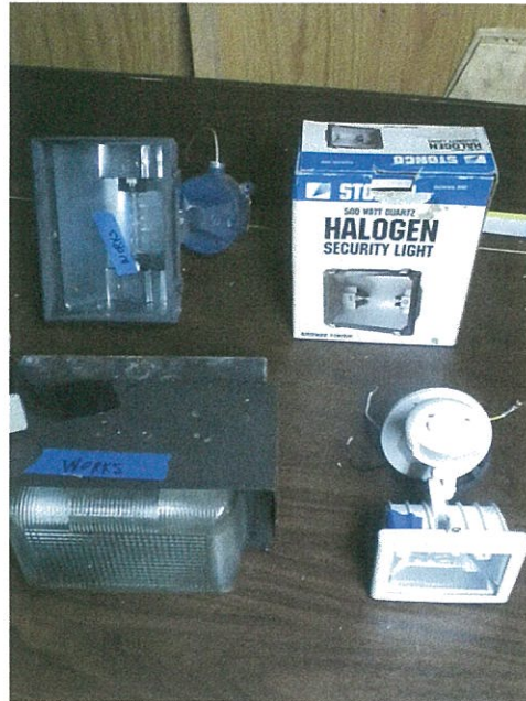
Metal Arc fixtures